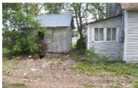
After Nuisance Abatement

“ SCEDD’s Nuisance Abatement Program has been the backbone of our efforts toward community development and has led to the revitalization of our City. Our annual six-week city wide cleanup this past year resulted in over 300 cubic yards of disposed items and 50 tons of construction materials were put into our C&D dump. We are thankful for SCEDD’s expertise! ”