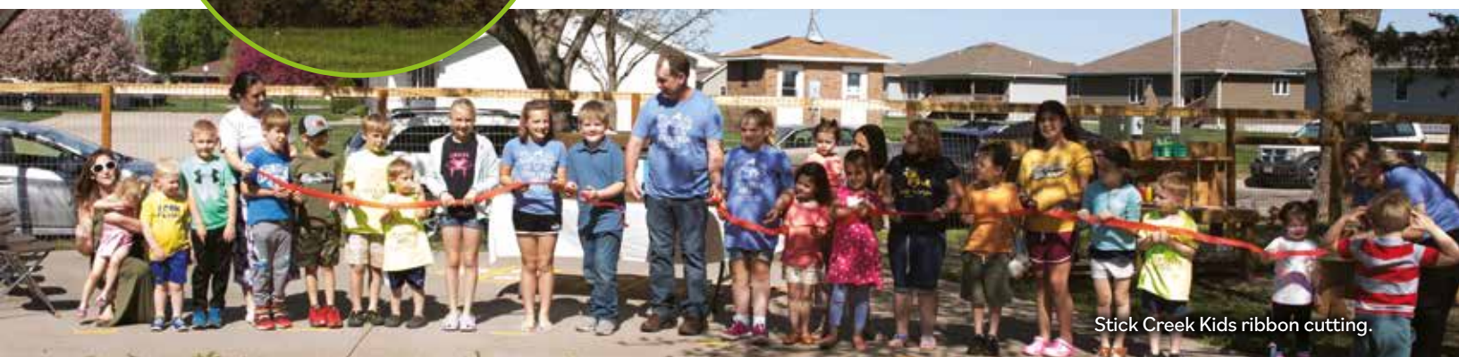
Stick Creek Kids ribbon cutting.