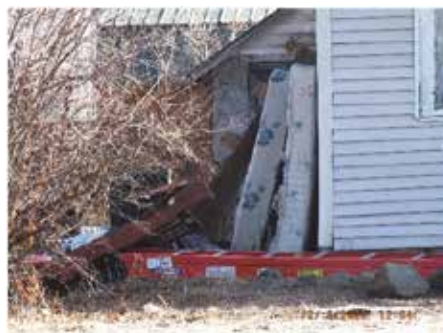
Before Nuisance Abatement