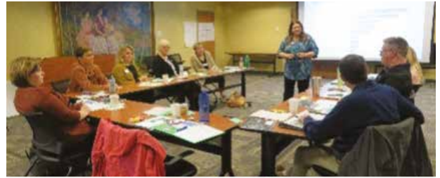
Pictured: Chamber Forum, Kearney, April 2021