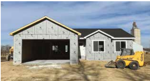
3 bedroom, 2 bath, family home in progress