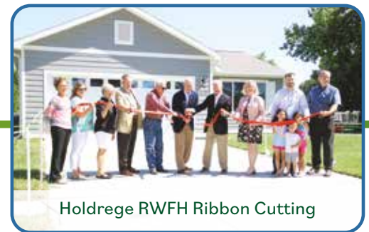
Holdrege RWFH Ribbon Cutting