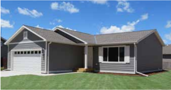
Holdrege RWFH New Construction

SCEDD's goal in 2021 was to see opportunities in spite of difficulties. Every community faces unique and difficult housing challenges that can limit economic growth. We are at work in many communities to help them overcome these challenges and develop solutions to address their unique housing needs.